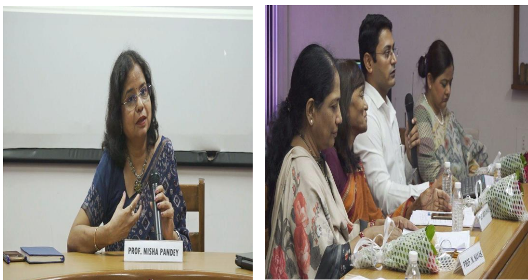
(National Workshop on “Voices of Farmer Champions as Advocacy Tool for Alternative Crops to Tobacco: Sharing Best Practices among Fellow Farmers)