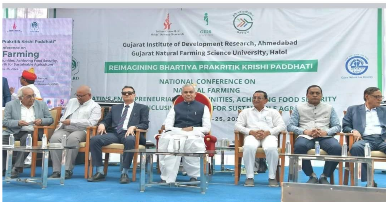
Reimagining Bhartiya Prakritik Krishi Paddhati; Creating Entrepreneurial Opportunities, Achieving Food Security, and Promoting Inclusive Growth for Sustainable Agriculture